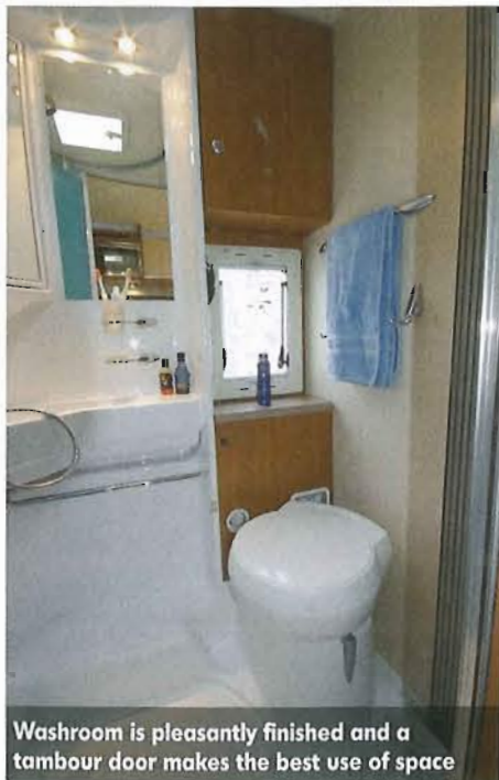
Washroom is pleasantly finished and a tambour door makes the best use of space