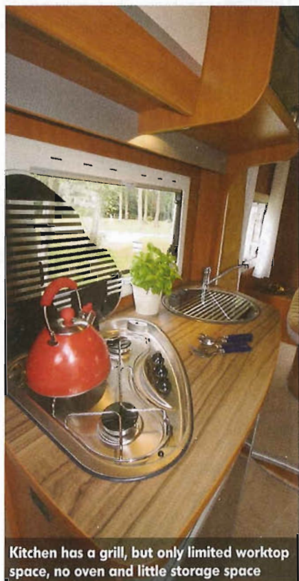
Kitchen has a grill, but only limited worktop space, no oven and little storage space

Chausson have shoe-horned an island bed into a sub-7-metre couples' van. Mark Sutcliffe takes a closer look at the new Welcome 72 and reckons they might just be onto something