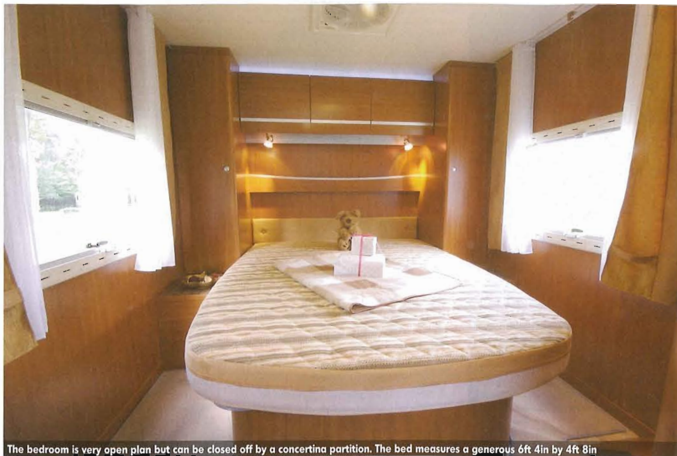
The bedroom is very open plan but can be closed off by a concertina partition. The bed measures a generous 6ft 4in by 4ft 8in

and a circular shower base with revolving partition. The warm air from the diesel-fired blown air heating is channelled in here and there's plenty of storage space, two towel rails and two spotlights over the vanity unit.