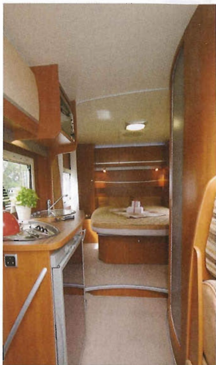
The washroom and kitchen squeeze central gangway. There's a shallow step up to bed

sense of space and light continues forward into the cab, whose headroom isn't in any way compromised by the overcab, much of which is taken up by that big sunroof.