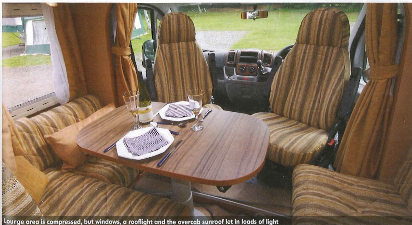
Lounge area is compressed, but windows, a rooflight and the overcab sunroof let in loads of light